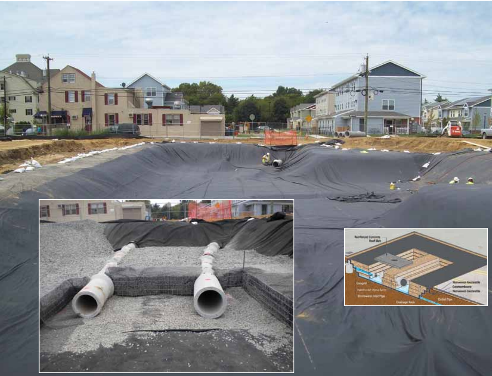
PVC geomembrane installation over underground chamber. Inset: Perimeter wall construction at pipe penetration. Schematic of patented geosynthetic based underground stormwater detention system.

Roosevelt Manor sits in the heart of Camden, New Jersey's Centerville neighborhood across the Delaware River from Philadelphia. Built in the