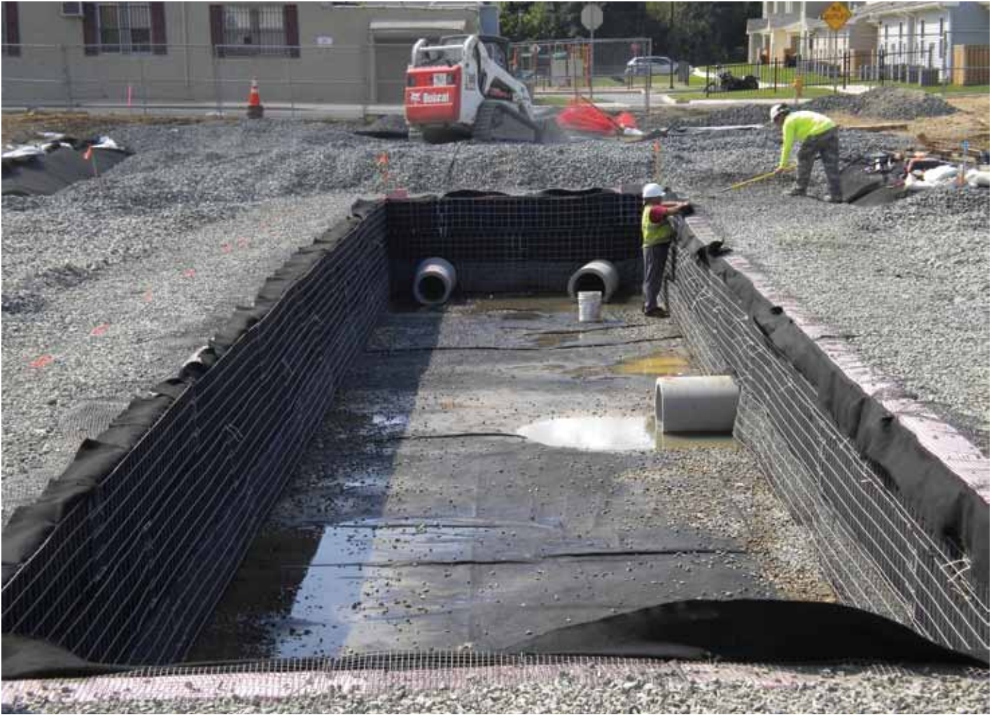
Stone walls are constructed around the perimeter of the lined excavation over the geomembrane and stabilized with geosynthetic reinforcement at tightly spaced lifts.

its doors the four acre development was demolished and with HopeVI funding from the U.S. Department of Housing and Urban Development, Roosevelt Manor was rebuilt.