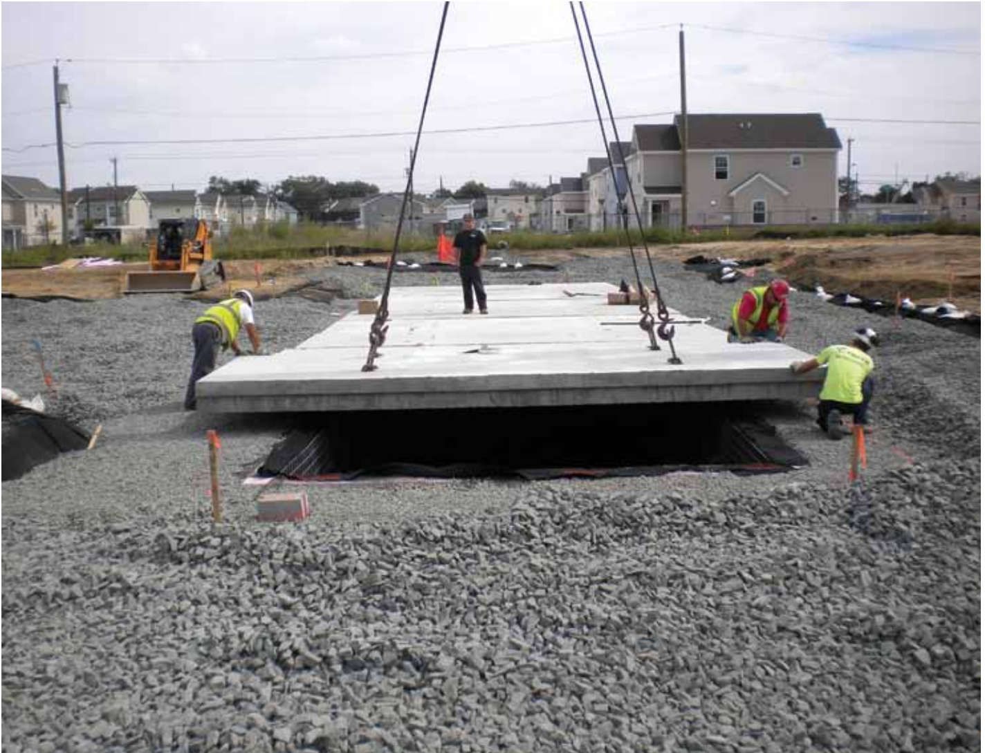
Stormwater detention system roof installation over chamber.

and also provides additional storage capacity. On larger projects an interior pier built in the same manner as the perimeter walls can expand the size of the chamber by supporting the concrete roof panels. At the wall face, the geosynthetic reinforcement is wrapped to retain the stone backfill and welded wire forms are utilized to enable compaction. Inlet and outlet pipes extend through the perimeter liner system and the geosynthetic wrapped stone wall face into the open chamber. The outlet pipe is typically connected to a downstream manhole with a flow control weir containing orifices that restrict flow for all but the largest storm events. Another important feature of this geosynthetic based system is the large chamber enables access for future sediment inspection and removal, an important consideration for the city's municipal department responsi-