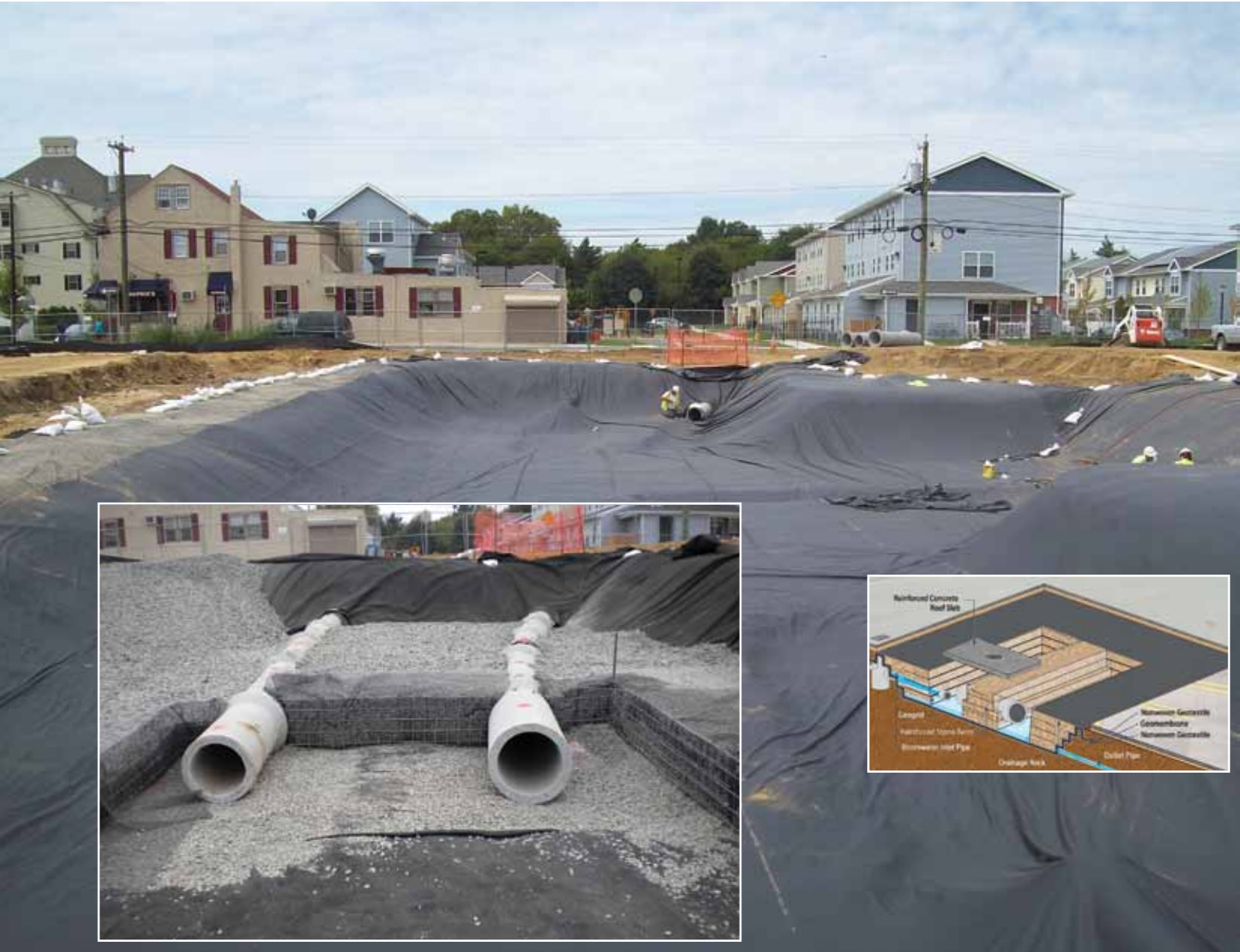
PVC geomembrane installation over underground chamber. Inset: Perimeter wall construction at pipe penetration. Schematic of patented geosynthetic based underground stormwater detention system.

Roosevelt Manor sits in the heart of Camden, New Jersey's Centerville neighborhood across the Delaware River from Philadelphia. Built in the