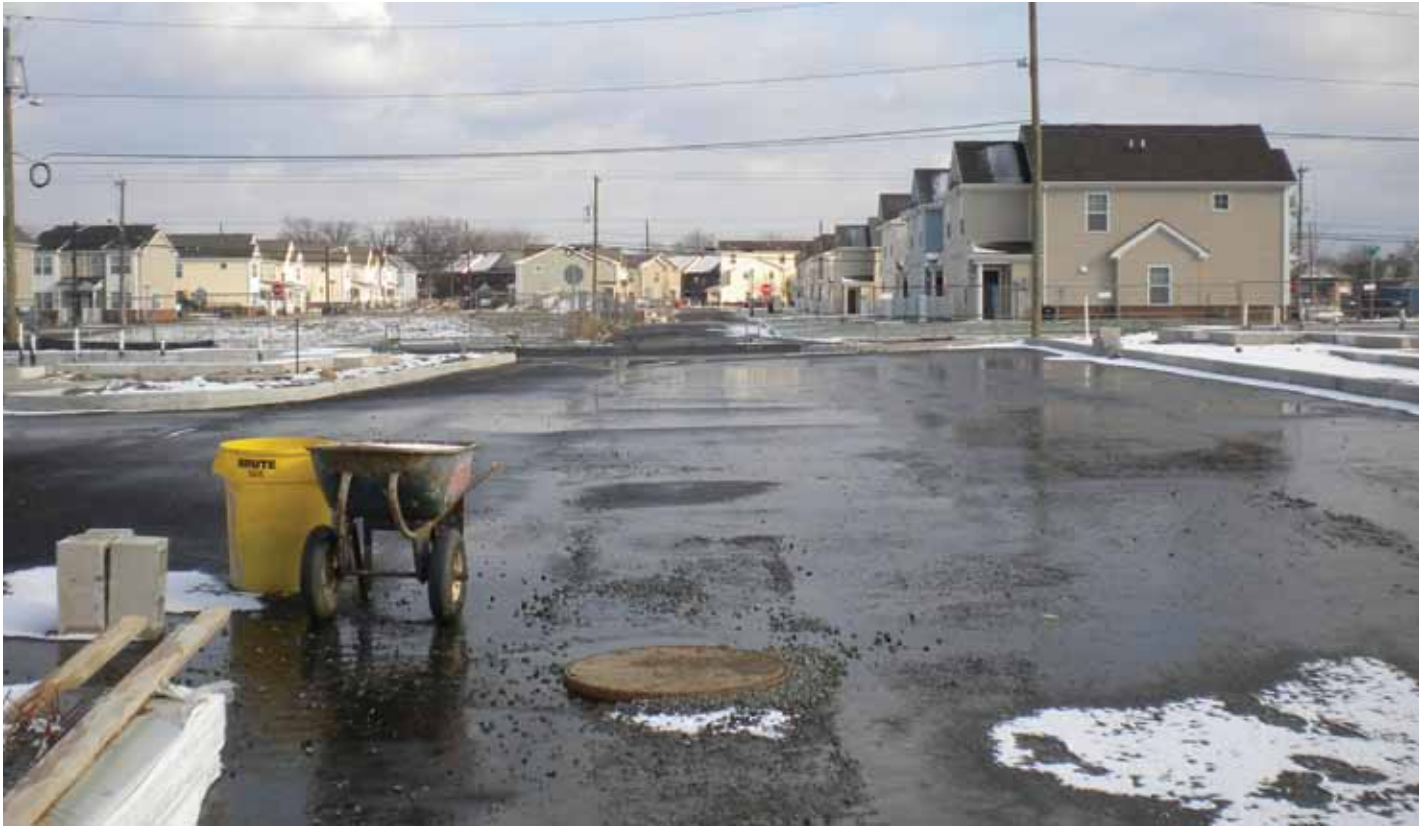
Roosevelt Manor with underground stormwater detention system below the street.

are also located in Roosevelt Manor. In these two systems a stone placement box was added to the operation to create a moving stockpile and reduce the stone waste factor. The Housing Authority of the City of Camden supervised all construction at the site and other city agencies will be responsible for the inspection and maintenance of the stormwater management system.